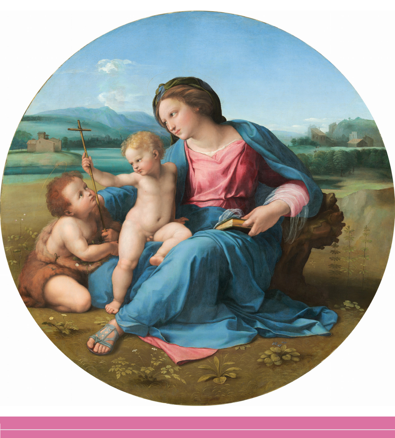
Third Sunday of Advent: December 13, 2020